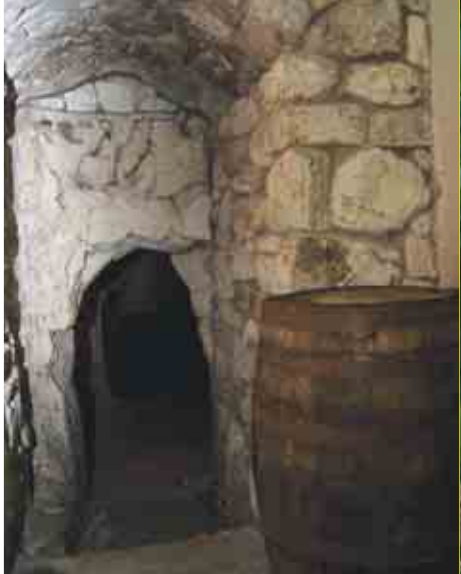
Inside a Winery in Kathikas

Before we continue our exploration, we can make an interesting side visit to