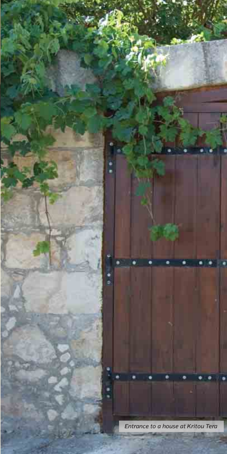
Entrance to a house at Kritou Tera