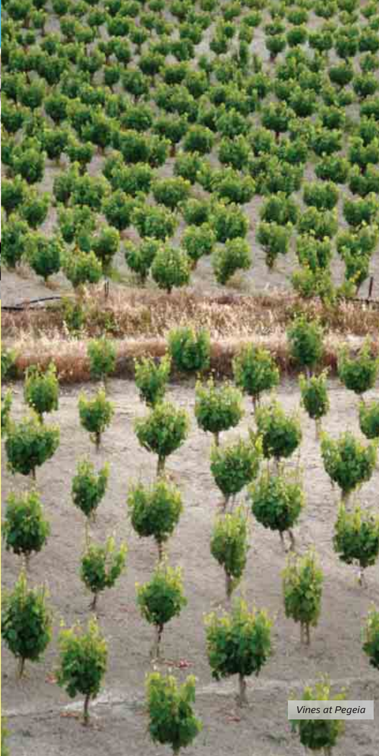
Vines at Pegeia