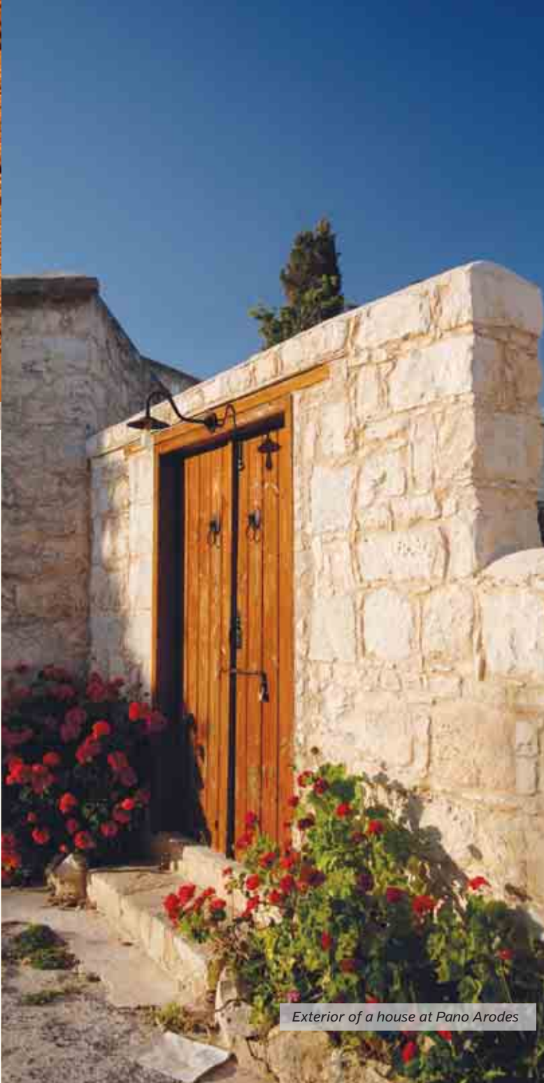
Exterior of a house at Pano Arodes