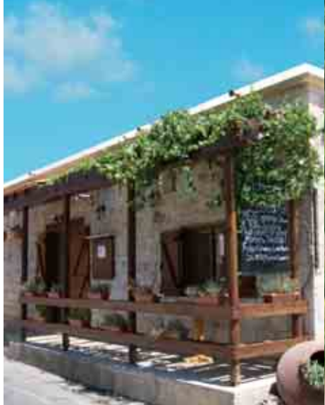
A picturesque Taverna in Kathikas

The paths we take in Akamas quickly demonstrate what a unique place it is, with much more than superficial views. For anyone interested in geology, vegetation and wild life, it is a place where time spent rewards the visitor.