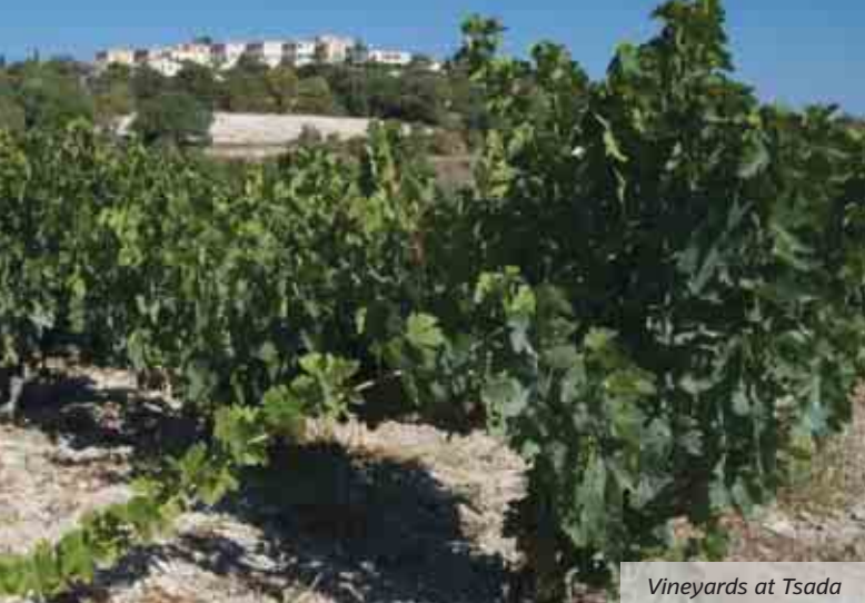
Vineyards at Tsada