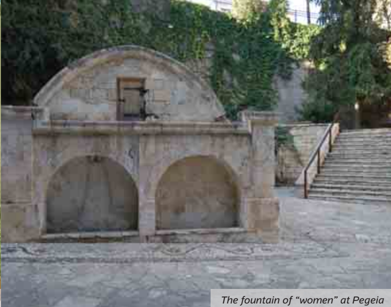
The fountain of “women” at Pegeia