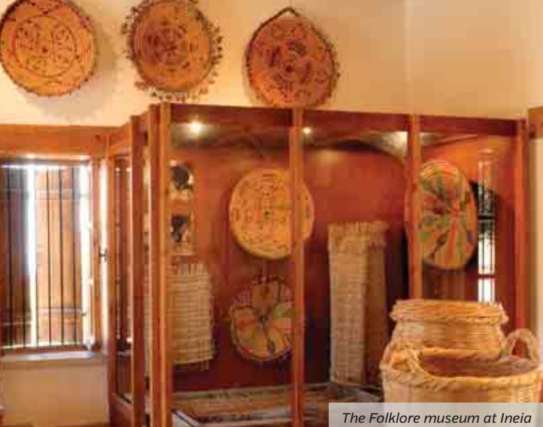
The Folklore museum at Ineia

the visitor with small houses, shops selling local produce, as well as places to eat. Kathikas has two wineries, both worth a visit.