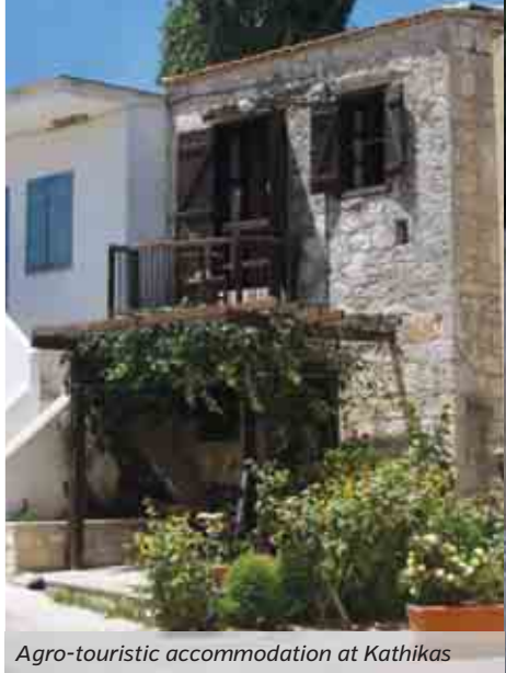
Agro-touristic accommodation at Kathikas