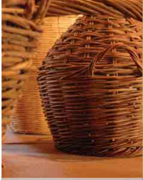
A fine sample of a wicker wine case

A cup of Cyprus coffee, with its attendant glass of cool water, is also a good idea -to clear taste, smell and our appetites for delights to come!